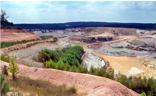
Washington County Kaolin Mine